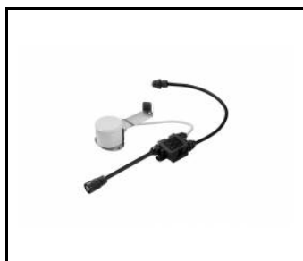
OCULUS LED - RCR motion sensor (964244)