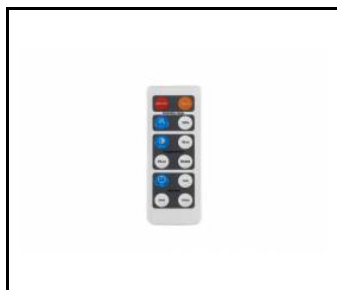
Remote control for motion sensor HD01R (WSEL438)