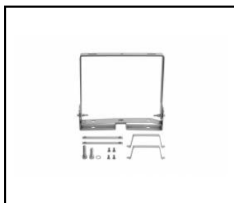
OCULUS LED - universal handle-lack of compatibility with Dali version 294W (964886)