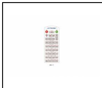
WSEL415 Remote control for - PIR sensor (WSEL415)