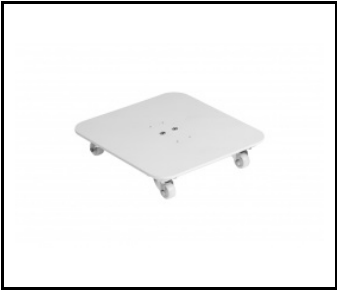
Set of guide wheels Sterilon Flow 72W matt white (243646)