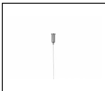
SINGLE SUSPENDE CORD (171512)