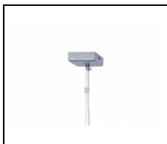
SINGLE ELECTRICAL SUSPENDE CORD (SQUARE BOX) TABLO NT (171710)