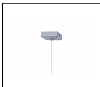
SINGLE SUSPENDE CORD (SQUARE BOX) (171642)