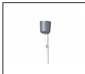
SINGLE ELECTRICAL SUSPENDE CORD (ROUND BOX) TABLO NT (171703)