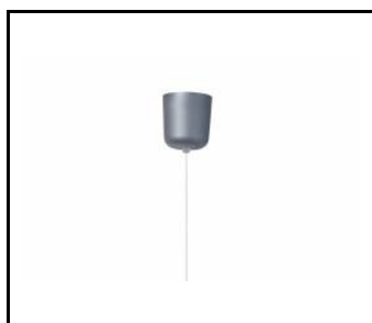
SINGLE SUSPENDE CORD (ROUND BOX) (171635)