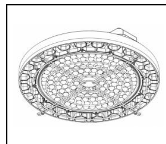
OCULUS LED- safety net kit (561382)