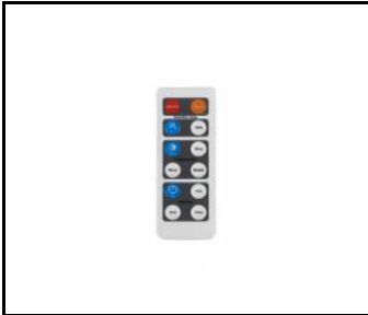
Remote control for motion sensor HD01R (WSEL438)